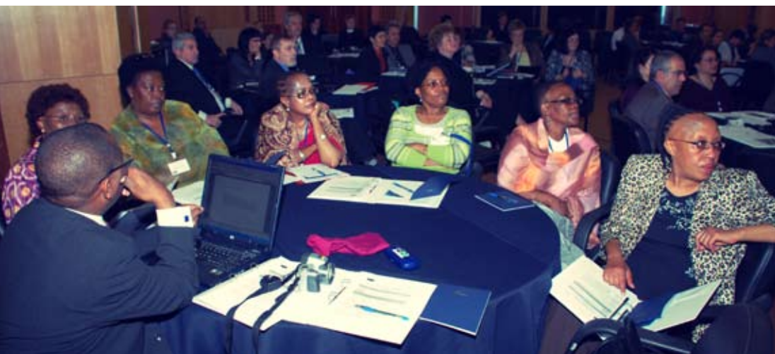
Planning for sustainability session

Librarians from 47 countries benefited from three days of intensive learning, and the opportunity to share knowledge and best practice with colleagues in other countries.