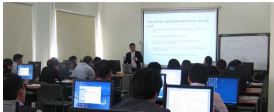
FOSS training workshop, Mongolia

In Armenia, 30 libraries went live with their Evergreen installation. During the pilot, the project team liaised closely