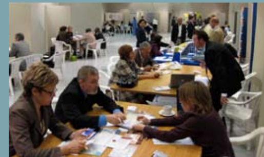
‘Speed-dating’ with vendors, 2009 General Assembly

In addition to regular communication via email, we organize ‘speed-dating’ sessions at our General Assembly to enable representatives from partner countries to meet with vendors face to face.