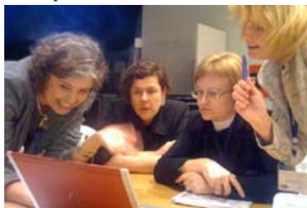
Meeting with library partners, 2009 General Assembly

A new staff member with extensive experience of marketing e-resources has been appointed, and a communications strategy has been developed.