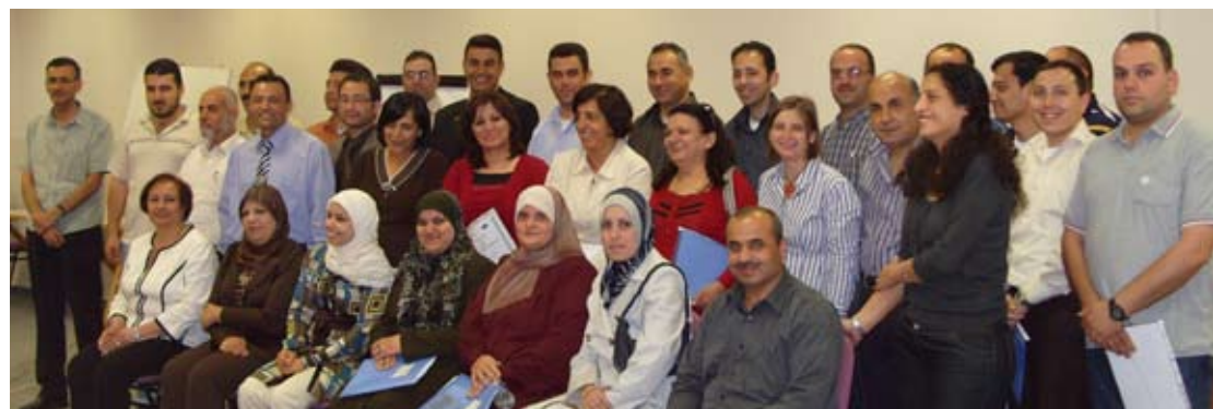
Open access workshop, Palestine

Our network has been behind many important national initiatives to promote open access to publicly funded research – for example, in Belarus, China, Hong Kong, Lithuania, Moldova, Russian Federation, Ukraine and South Africa.