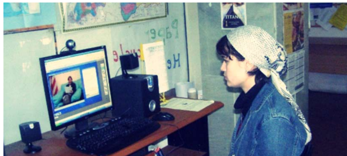
Librarian in Tajikistan participating in EIFL-PLIP webchat