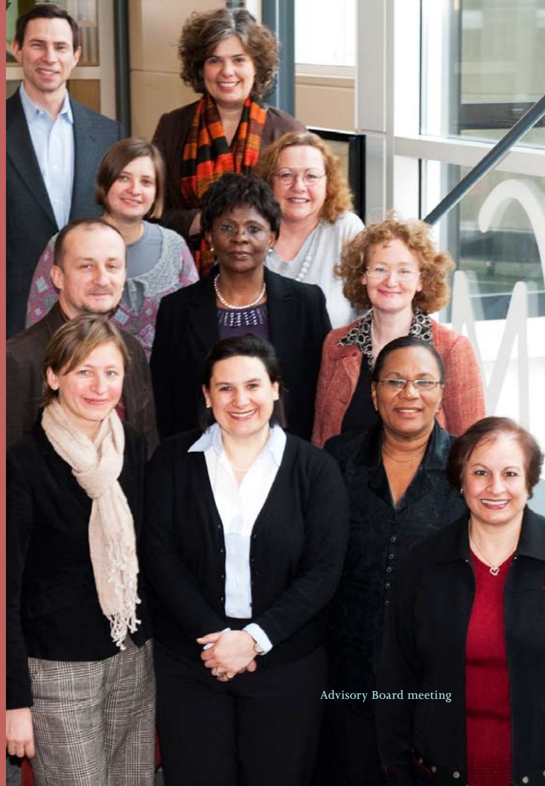
Advisory Board meeting