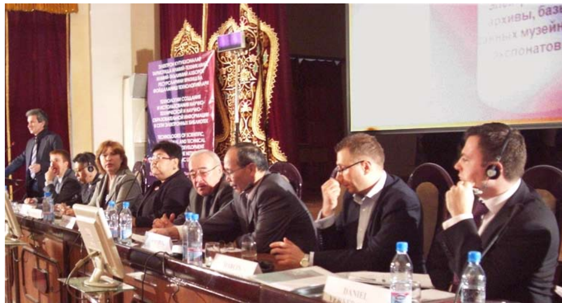
Vendor presentations, Uzbekistan

Our central negotiations and licensing work also results in significant efficiency gains across the network – for example, in terms of time and legal fees.