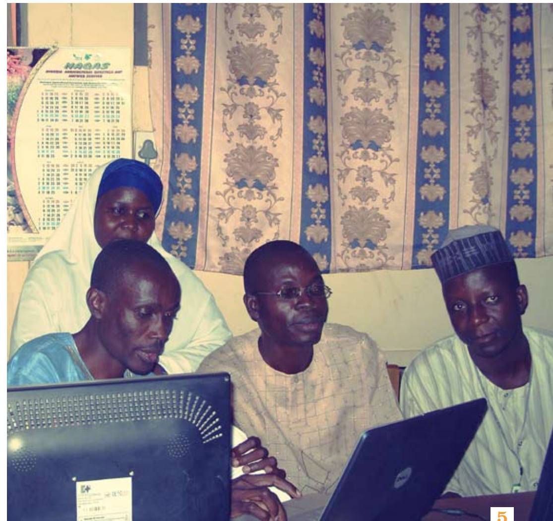
2nd Open Access Initiative workshop, Nigeria